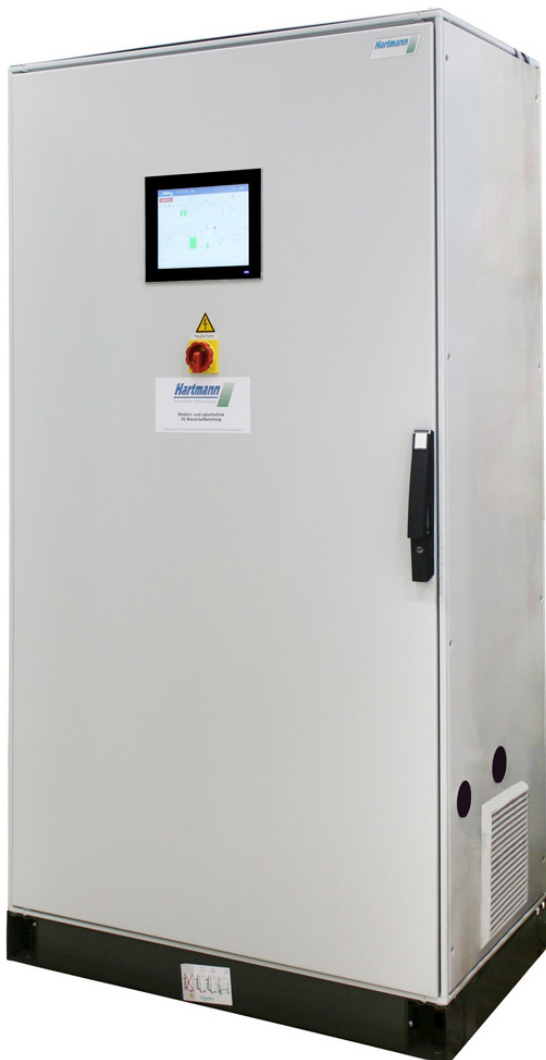
Bild: HA-RO complete / variant up to 500 l/h

FULLY DEMINERALIZED OR PURE WATER TREATMENT FOR MEDICINE, PHARMA, LABORATORY AND INDUSTRY